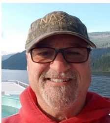
John King Life Group