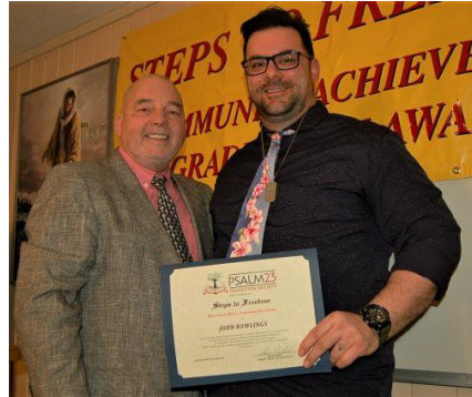
John Rawlings Foundation Phase Graduation